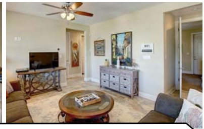
Two Separate Living Areas!