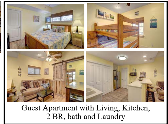
Guest Apartment with Living, Kitchen, 2 BR, bath and Laundry