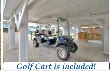
Golf Cart is included!