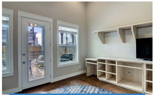
6th bedroom / unfurnished