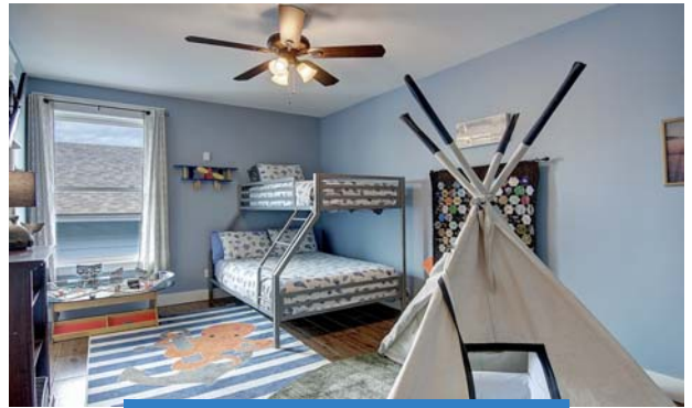
4th bedroom of 6