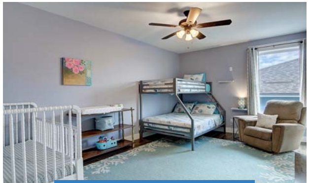
3rd bedroom of 6