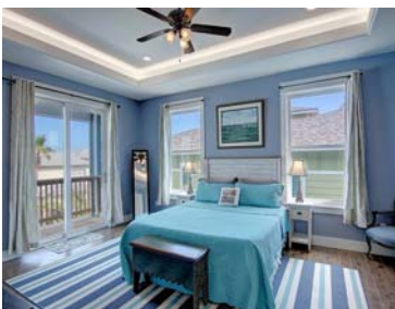
Master Bedroom with ensuite bath