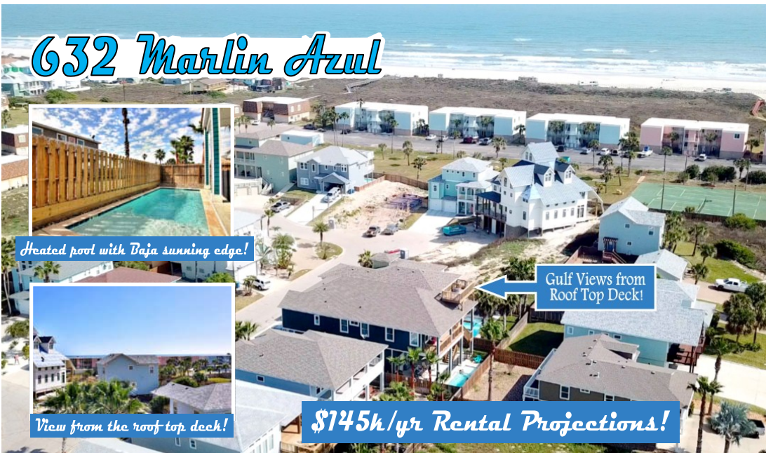
Heated pool with Daja sunning edge!