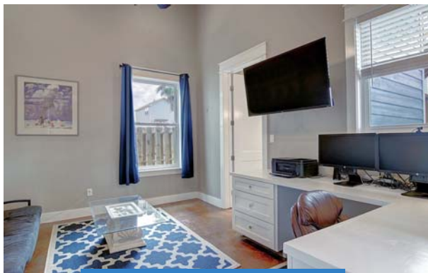
5th bedroom of 6