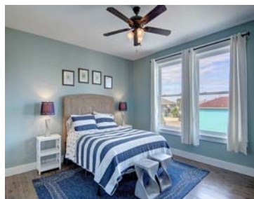
Second Master bedroom also with ensuite bath