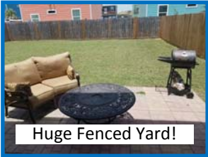
Huge Fenced Yard!

Beautiful 4 BR, 2.5 bath home just STEPS from the sand! This coastal cutie comes fully furnished w/room for all your family & friends. Features quality finishes throughout: granite counters, stainless appliances, white cabinetry, tile flooring, more! 2-car garage for your golf cart & beach toys! Main floor entry impresses w/ vaulted ceilings into living room. Open-concept floor plan leads to dining, kitchen & covered rear patio. Big Fenced yard: add a pool & even a guest cottage! Master BR w/luxurious ensuite bath is