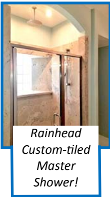
Rainhead Custom-tiled Master Shower!

PRIME location for investment rental income!