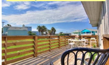
Room for a Pool!