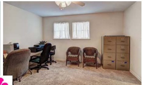
3rd, 4th, and 5th Bedrooms share the Third Bathroom