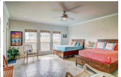
4th Sleeping Area