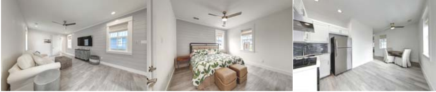
Apartment w/ bed, bath, living, kitchen can be locked off.