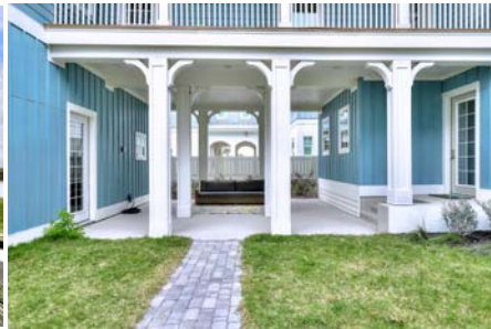
Room for a private pool!