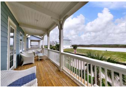
Spacious Decks w/ Views!