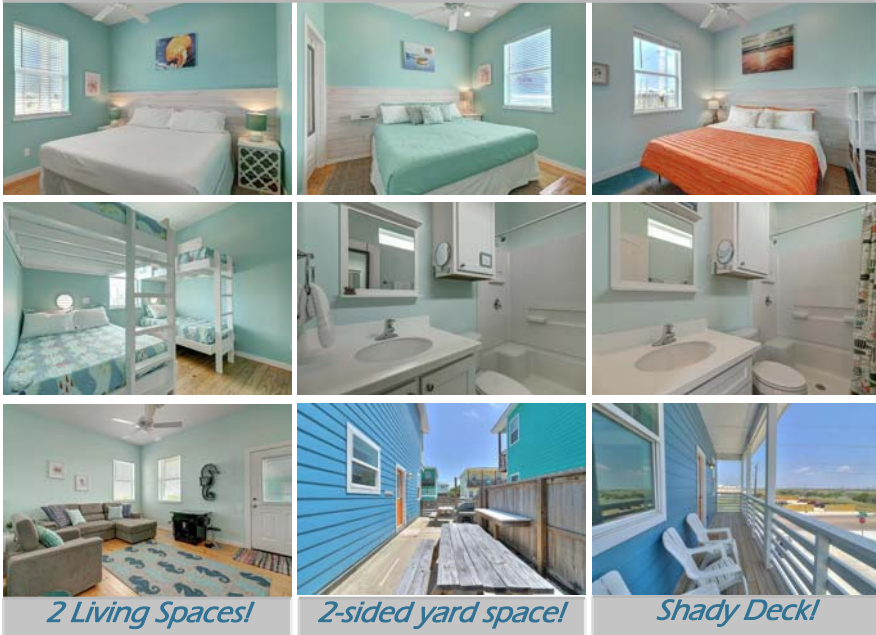
2 Living Spaces!

High Ceilings, Cute Decor, Amazing Income!