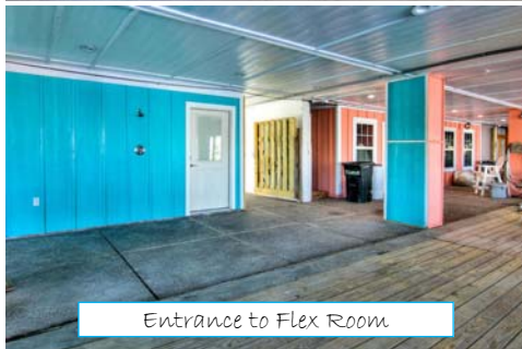
Entrance to Flex Room