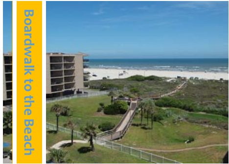
Boardwalk to the Beach