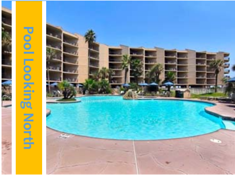
Pool Looking North