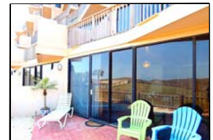
Huge entertaining patio boasts afternoon shade!

Insurance ~$1220/year includes rental income coverage!