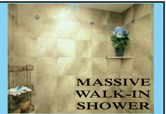
Fully remodeled kitchen and bath!