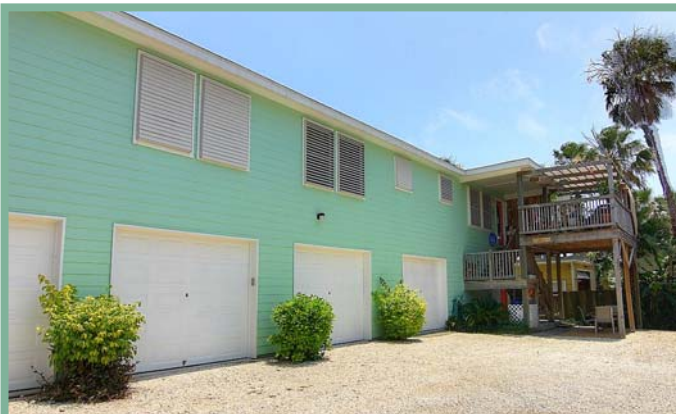
4 Plex with 4-car garage