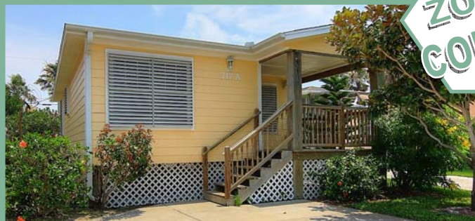
Two 2-bedroom Cottages

Rent this property long term or short term or operate as a business. The possibilities are endless!!! Tucked away in the heart of Port A, and convenient to restaurants, shops & shops & the beach!!!